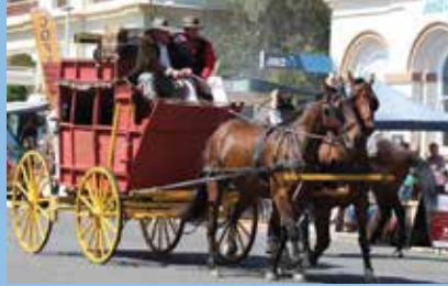
BUSHRANGER THEME. This year the Pumpkin Festival will have a bushranger theme. "ANT 1" - THE MUSICIAN will be back this year to perform TWO FREE concerts for the kids.